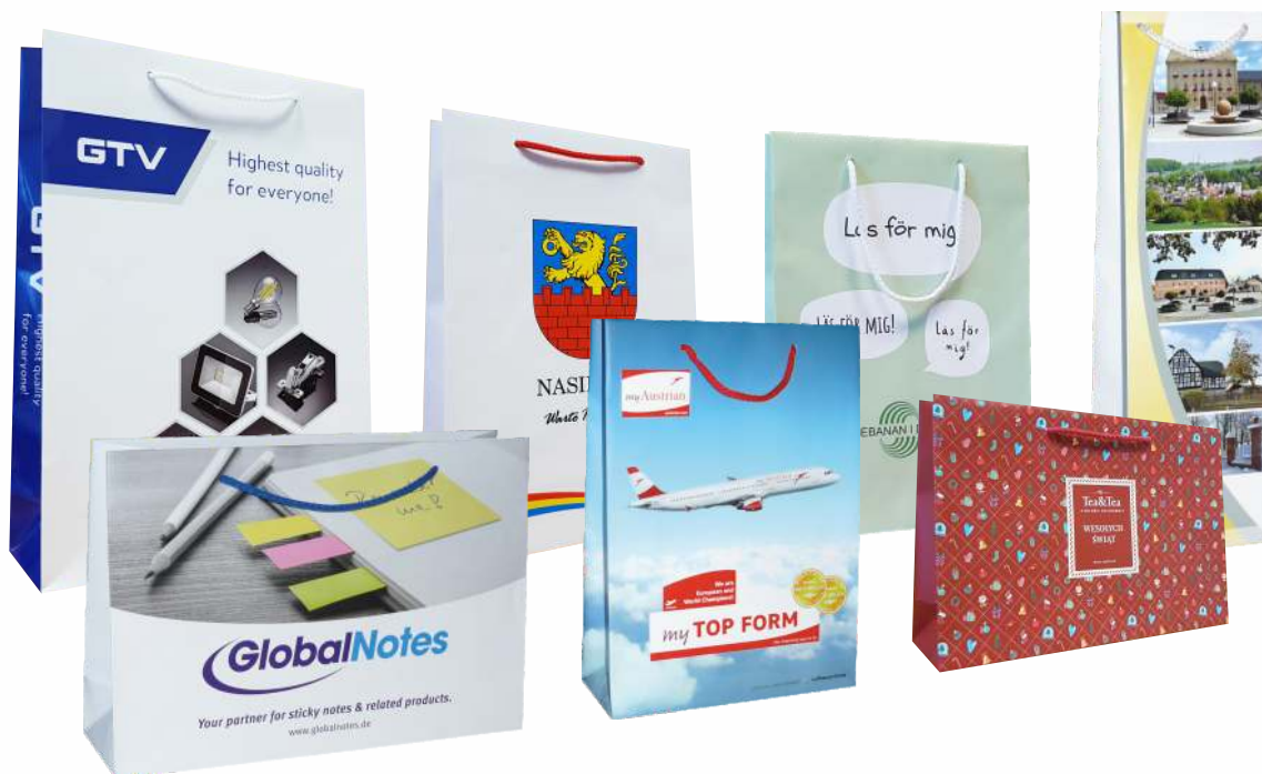
Colors of bags for screen printing (on request)

MOQ offset print from 100 pcs. depending on the format of the bag, screen print and digital from 50 pcs.